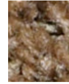
00703 MOCHA CHIP