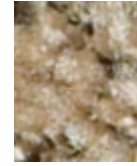
00702 SWEET TEA